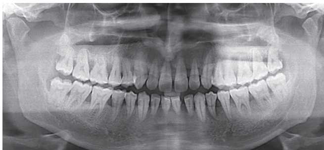
Fig. 2: Panoramic radiograph showing bifid mandibular condyle